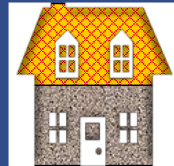
■ Horizonti ■ HFH Macedonia