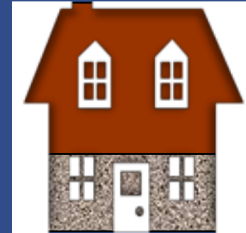
■ Moznosti ■ HFH Macedonia